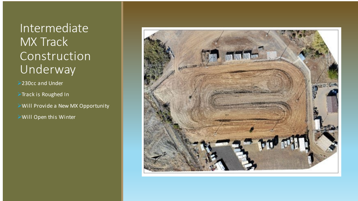
Figure 2 Ariel view of Intermediate MX Track under construction.